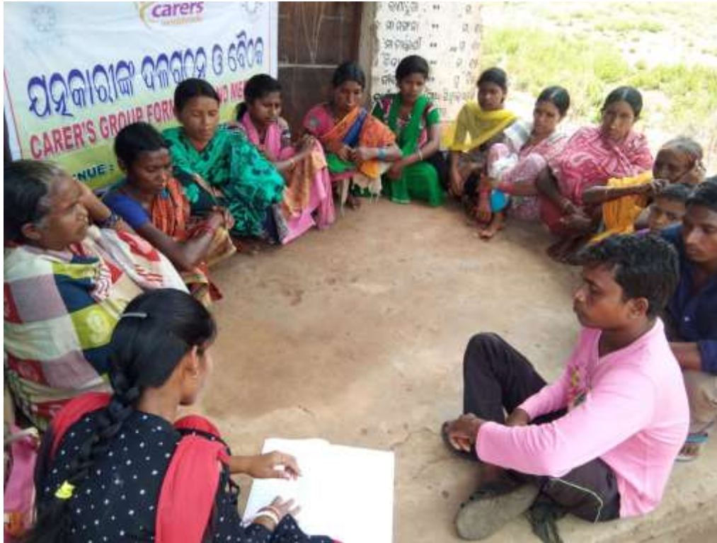
Carers Group meeting in Progress