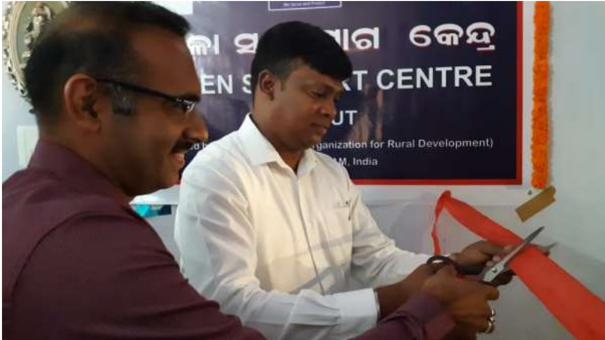
District Collector and Superintendent of Police inaugurating the WSC, Koraput

The project is just picking up pace and we hope that this initiative will definitely support many women who are bearing the brunt of violence in family and community.