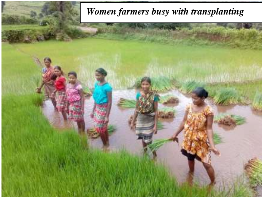
Women farmers busy with transplanting