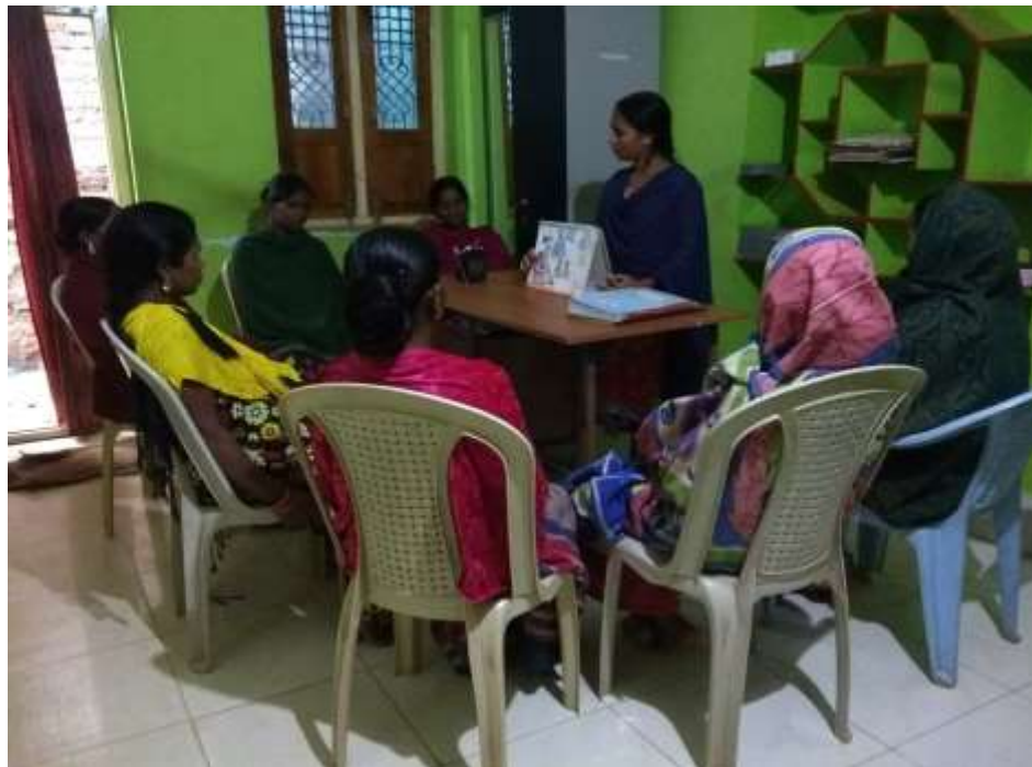
Counselling Session to Women in Maa Gruha, Laxmipur on Exclusive Breast feeding